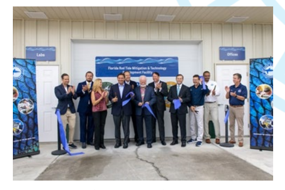
Facility Grand Opening