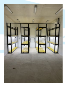
Red Tide Culture