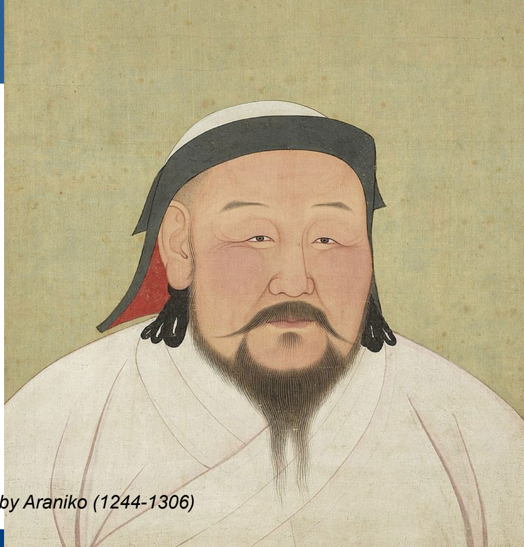
Portrait of Kublai Khan by Araniko (1244-1306)