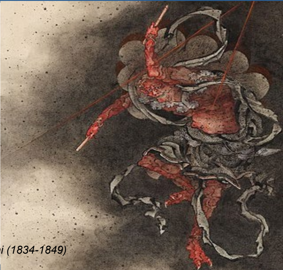
Raijin by Katsushika Hokusai (1834-1849)

Responsible for the Destruction of the Mongol Fleet