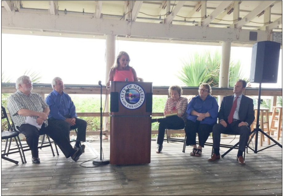
Sen. Latvala, Comm. Saunders, Rep. Peters, Debbie Flack, Tamara Pigott, Clark Hill

Septic Tanks - HB 551 by Representative Stone and SB 874 by Senator Young set aside $20M in LATF dollars annually to retrofit septic tanks or connect homes to central sewer in the Indian River Lagoon and St. Lucie and Caloosahatchee Estuaries. The Governor's Budget proposed a $40M matching grant program for local governments funded with general revenue.