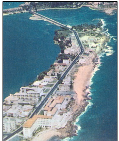
Figure 2: Example of Section 204 Project in Condado Lagoon, Puerto Rico

USACE can restore, protect or create aquatic and wetland habitats in connection with construction maintenance dredging of an authorized federal navigation project. The cost share under this program is 65 percent federal and 35 percent non-federal for all costs above the base disposal plan, where the base disposal plan is the least costly for typical disposal of dredged material. The federal government pays 100 percent up to the cost of the base disposal plan. The maximum federal limit is $10 million per project.