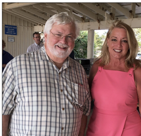
Sen. Latvala and Rep. Peters

Senator Jack Latvala and Representative Kathleen Peters unveiled comprehensive beaches legislation on Friday at Naples Lowdermilk Park, and with the 2017 Legislative Session beginning on Tuesday, March 7 th , the timing was perfect. The legislation, initially proposed during the 2016 Annual Conference in Naples, revisits beach and inlet project ranking; ensures funding is used for projects in greatest need to address the state's most severe erosion problems; and requires FDEP to establish a three-year work plan allowing local governments more time to prepare to fund and construct projects. One difference between the two bills, Senator Latvala proposes $50 million from the Land and Acquisition Trust Fund for beach and inlet projects. Senator Latvala told the Naples Daily News, "I don't have a higher priority in terms of the 15 bills that I sponsored this year."