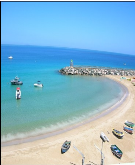
Figure 1: Example of Section 107 Project in Aguadilla Harbor, Puerto Rico

USACE is authorized to construct bank stabilization and protection projects to protect endangered public and non-profit infrastructure from flood and storm damages due to erosion. Examples of protected infrastructure include highways, bridges, approaches, cultural sites, and essential public services such as hospitals and water supply systems. Privately owned property and facilities are not eligible for protection under this authority. The maximum federal limit is $5 million per project.