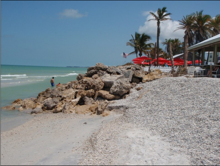
Shoreline in front of the Beach House Restaurant in Manatee County, following the passage of Tropical Storm Debby in June 2012.