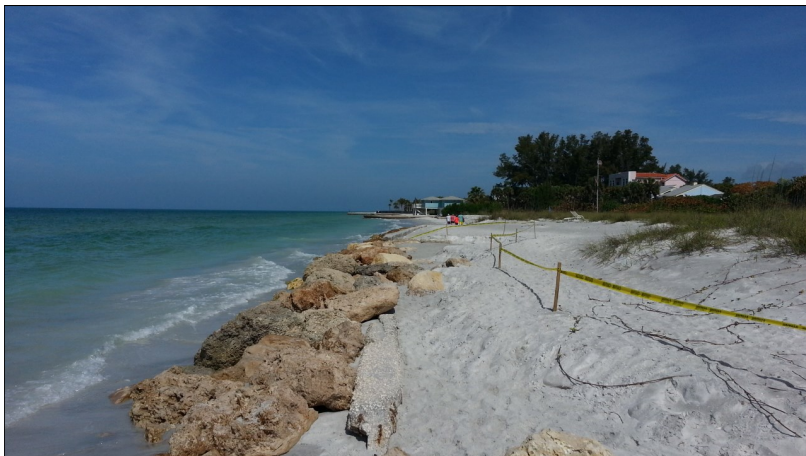
Longboat Key, Gulfside Road section (4-14-14)

At the starting point, beach funding for FY 2014/15 is a considerable distance apart with $27.7 million in the House and $49.2 million in the Senate. While challenging in the magnitude of the difference in dollars and individual projects in the House and Senate, especially in a shortened conference window, it is still a good starting position for pursuing FSBPA's primary session goal of substantially increasing statewide beach and inlet management funding from the Agency's and Governor's FY 2014/15 recommendation of $25 million. Our mutual strategy going forward is quite simple: get as close to the Senate funding level as possible, and fund as many projects in the order presented in DEP's LGFR, with just a select few adjustments in the amount of funding based on the availability of or prospects for expedited construction and federal matching dollars. There will not be any Agency support, and there are just a few "beach" lawmakers involved at the conference subcommittee level. In turn, it is imperative to take every opportunity to reinforce specific local government funding requests with members of your legislative delegations as well as appropriations conferees. It's now or never.