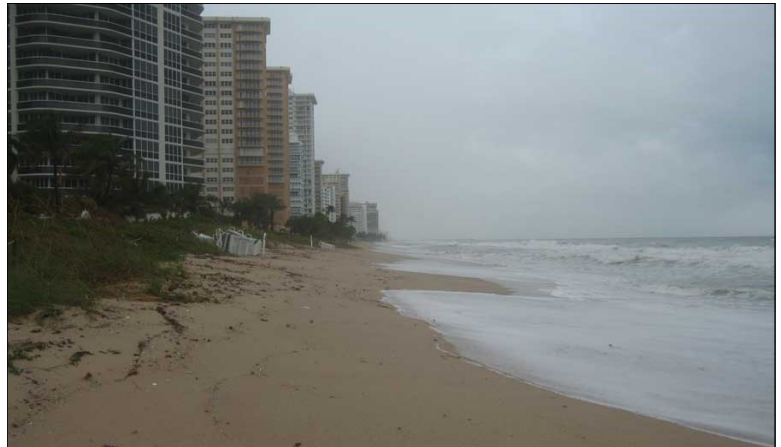
Broward Segment II -- Post-Sandy

To reiterate, this is an urgent and immediate point in time to let lawmakers and the Governor know, using any means available, just how important beaches are to our