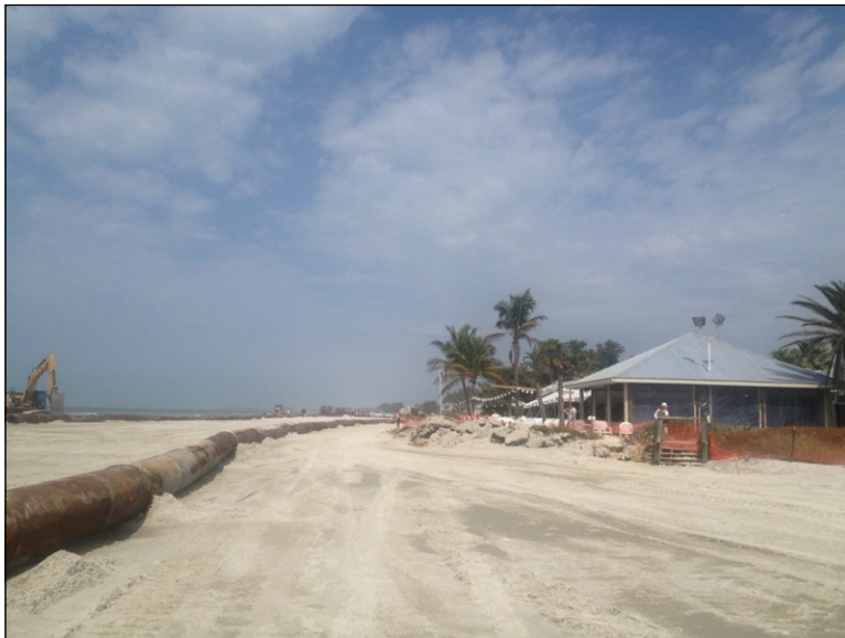
Shoreline in front of the Beach House Restaurant in Manatee County, during the recently completed nourishment.