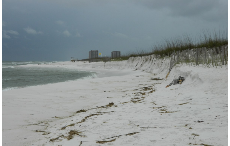
Pensacola Beach (4-8-14)

With the big funding difference of $21.5 million in the House and Senate appropriations bills, it is not surprising to see an exceptionally large number of projects that will be part of the upcoming Appropriations Conference process. Not surprisingly the more costly, higher ranked projects tend to be in the Senate Bill. The House proposal goes further down the list but skips some of those larger ticket projects. Likely conferenced projects (in order presented in DEP's LGFR): Palm Beach County Shore Protection Project-North Boca Raton Segment, Pensacola Beach Nourishment, Jupiter Island Beach Nourishment, Wabasso Beach Restoration, Broward County-Segment II, Bonita Beach Nourishment, South St. Lucie Beach Restoration, Charlotte County Beach Restoration, Marathon Beaches Emergency Repair, and Brevard County-Mid Reach.