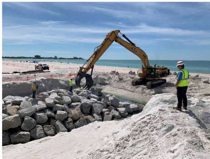
Construction of groin on Lido Key - March 2021

Lido Key also benefits from an authorized Federal beach project which includes over 1.5 miles of beach berm and two rock groins near South Lido Beach. Initial construction of the Lido Key beach project was completed in April 2021. The beach is estimated to be on a 5-year renourishment cycle with the actual timing to be informed by annual monitoring. While Longboat Key does not benefit from a Federal beach project, Section 8201 of the Water Resources Development Act (WRDA) of 2022 provided authorization of proposed feasibility studies to include the Town of Longboat Key, Florida for whole island hurricane and storm damage risk reduction. Future initiation of the feasibility study will be dependent upon the project being selected as a new start study and associated allocation of federal funds as part of the annual Congressional process.