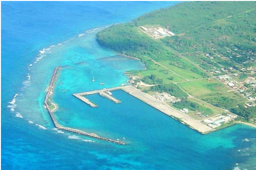
Figure 1: Tinian Harbor

susceptible to the coastal storms, tsunamis, and drought. The panel also included specific case studies at Tinian Harbor (Figure 1) and Waikiki Beach, HI (Figure 2).