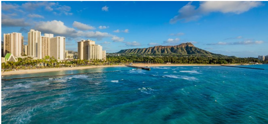
Figure 2: Waikiki Beach

The second panel of the CERB was titled “Coastal Structures State of Practice”. The panel included discussions on coastal structure design, construction, maintenance, and identifying when to repair a coastal structure. Innovative construction techniques for highly corrosive marine environments were also discussed including protective coatings and new concrete add mixtures to reduce permeability. The rest of the panel focused on enabling ship to shore movements, including a floating double deck pier developed by Naval Facilities Engineering Command (NAVFAC), and a demonstration of the Port Improvement via Exigent Repair (PIER) Joint Capability Technology Demonstration (JCTD) which is designed to provide warfighters a suite of rapid repair capabilities to reconstitute a damaged or degraded seaport facility.