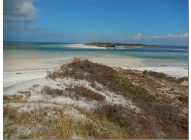
FDEP photo of breach across St. Joseph Peninsula, Gulf County following Hurricane Michael

The Critically Eroded Beaches Report for 2019 has been updated and posted to the Department's web page. This is the Department's report that lists segments of shoreline that have been designated as critically eroded and therefore eligible for state cost share for a beach restoration or nourishment project. In the 2019 report, there are three additional segments listed, found in Franklin County (R52-R59.6), St. Johns County (R117-R117.5), and Flagler County (R70-R72). One segment was delisted along the western end of Perdido Key (R1-R19) in Escambia County. For more information, visit the Department's Critically Eroded Beaches page at https://floridadep.gov/water/engineering-hydrology-geology/documents/critically-eroded-beaches-florida .