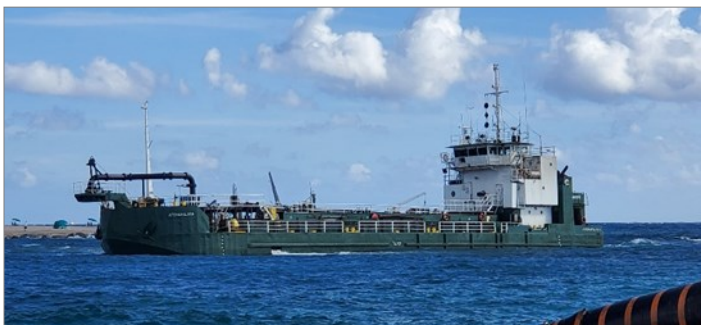
Picture 1. Hopper Dredge Atchafalaya in Palm Beach Harbor entrance channel (2022).

Under the current Florida Department of Environmental Protection (FDEP) joint coastal permit, dredge material from the Palm Beach Harbor project may be placed on the dry beach between R-monument 76 (R-76) and R-80.35 or in the nearshore placement area landward of the -17-foot mean low water (MLW) contour. Each time a harbor maintenance event with dry beach placement is planned, the Port, as the non-Federal sponsor, must provide a lands certification to USACE so that USACE and its contractor may access the beach. Based on the estimated volume of dredge material and the Town-provided beach access location, the USACE, the Port, and the Town identify the properties adjoining the beach placement area that will need temporary construction easements. The Town plays a key role in the Port’s lands certification by obtaining the necessary agreements (i.e. temporary construction right-of-entry and temporary construction easements) from the various property owners and assigning those agreements to the Port and USACE for the project’s execution.