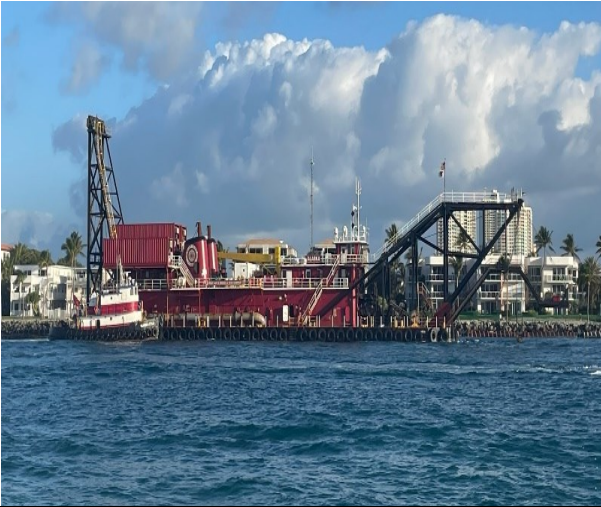
Picture 1. Cutter Suction Dredge Alaska in Palm Beach Harbor entrance channel (2023).

In order to continue placing material after April 30, 2022, coordination between USACE, the FDEP, the Florida Fish and Wildlife Conservation Commission (FWC), and the U.S. Fish and Wildlife Service (FWS) was conducted, and the regulatory agencies concluded under an FDEP permit modification that the time extension would not increase the probability of adverse impacts to nesting marine turtles or other coastal resources. Cashman completed all beach-related activities and demobilized by May 24 th .