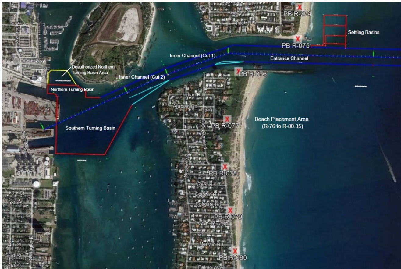
Figure 2: Palm Beach Harbor, Aerial Imagery