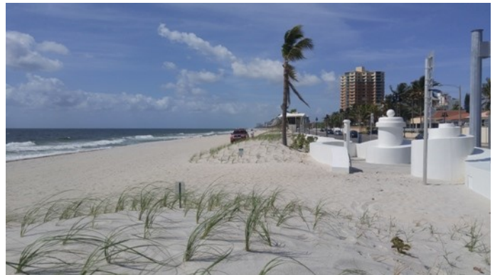
Portions of Broward County Segment II Shore Protection Project completed in 2016. Before & After photos taken at NE 18 th Street, located just a few miles north of the Westin.