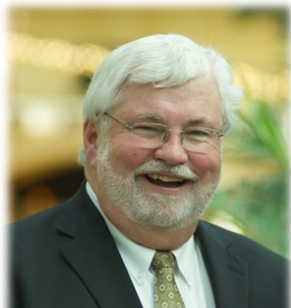
60 th Anniversary Statesman of the Decade Award Senator Jack Latvala