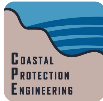
Gold Banquet and Flyer (Frisbee)