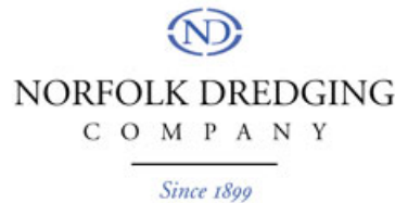
Friend of FSBPA