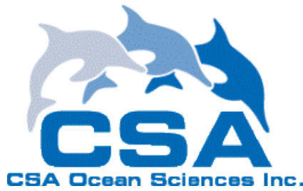
Silver Banquet Sponsor