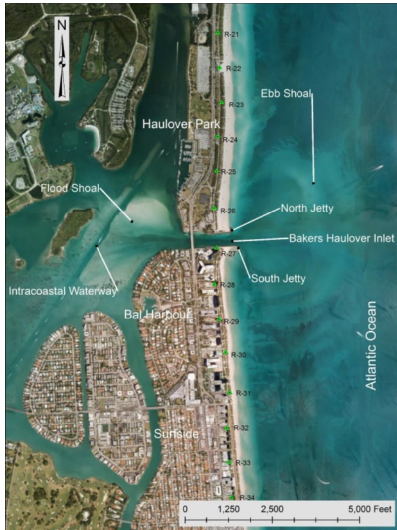
“Bakers Haulover Inlet, Google Earth imagery, 2019”

The Bakers Haulover Inlet Management Plan has been updated and posted on the department's website.