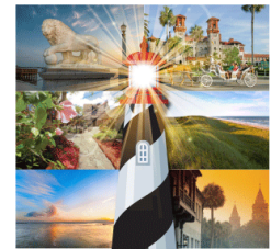
35th National Conference on Beach Preservation Technology February 2-4, 2022 - St. Augustine Embassy Suites

Embassy Suites by Hilton, St. Augustine Beach, Florida