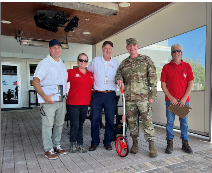
Manatee County and the USACE working together on post Hurricane Idalia surveys

This month marks the one-year anniversary of Hurricane Ian, among the top five strongest hurricanes to make landfall and the deadliest hurricane to strike Florida in nearly 90 years. The tragedy and lives lost are dolefully remembered, especially as September 28 approaches. Last week, Floridians were reminded again of the importance of preparing for hurricane season and heeding the advice of emergency managers, because no two hurricanes are alike and model predictions are just that - predictions. Hurricane Idalia was the first Category 3 landfall on record in the Apalachee Bay but not before bringing damaging storm surge and flooding along the Gulf Coast. Regrettably, lives were lost, and communities devastated, and undeniably, we can appreciate that more work is needed to support local government's efforts to be more resilient. Hurricane Idalia reinforced the importance of this message and the timely opportunity of the 2023 Florida Resilience Conference.