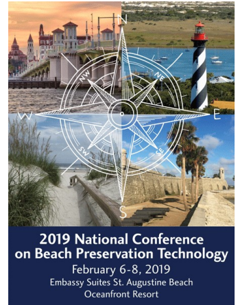
2019 National Conference on Beach Preservation Technology February 6-8, 2019 Embassy Suites St. Augustine Beach Oceanfront Resort

St. Augustine Beach Hilton Embassy Suites