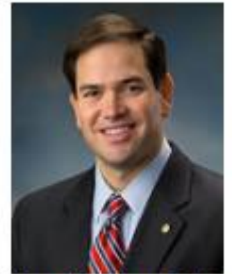
Senator Marco Rubio (R)