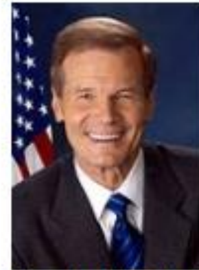
Senator Bill Nelson (D)