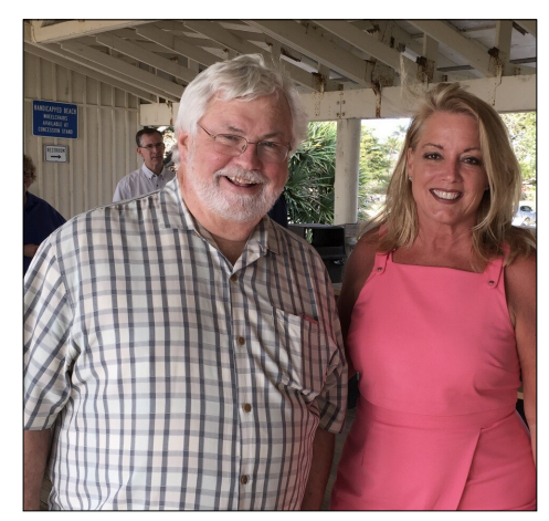
Sen. Latvala and Rep. Peters

Senator Jack Latvala and Representative Kathleen Peters unveiled comprehensive beaches legislation on Friday at Naples Lowdermilk Park, and with the 2017 Legislative Session beginning on Tuesday, March 7<sup>th</sup>, the timing was perfect. The legislation, initially proposed during the 2016 Annual Conference in Naples, revisits beach and inlet project ranking; ensures funding is used for projects in greatest need to