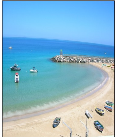
Figure 1: Example of Section 107 Project in Aquadilla Harbor, Puerto Rico

maximum federal limit is $5 million per project.