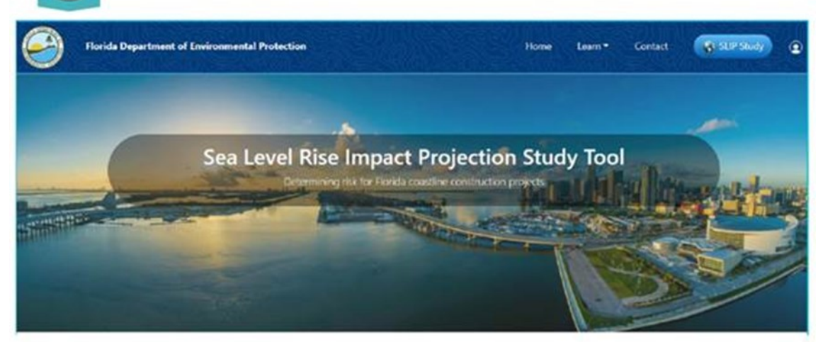
The above image is from the second rule development workshop. It shows the proposed home page of the SLIP study tool that will be on the Department of Environmental Protection's website.