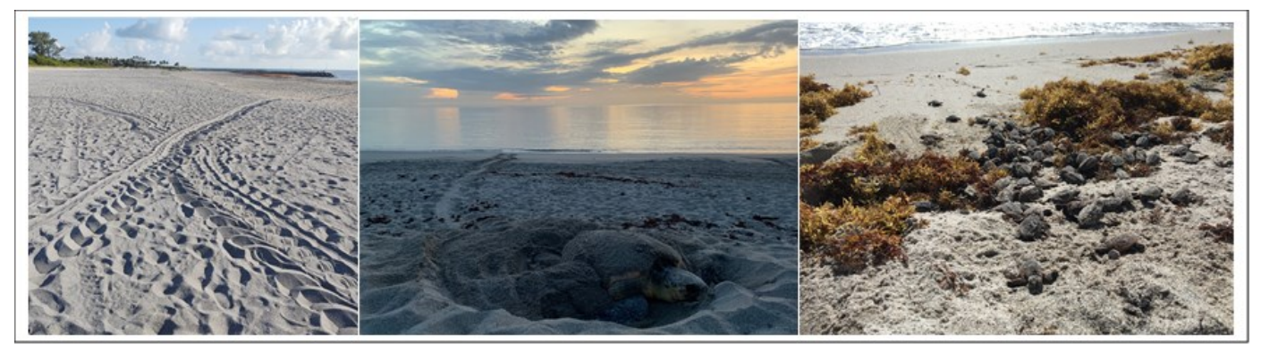
Figure 2: Sea turtle tracks on the beach in the northern portion of the study area (left), Nesting Sea turtle discovered during an early morning permitted survey (middle, photo credit: Heather Seaman), and freshly emerged hatchlings making their way to the ocean (right, photo credit: Heather Seaman). Next Page

The sedimentological and temperature data will be compared to sea turtle nesting, hatching, and emergence success (NS, HS, and ES, respectively) of the three local nesting species of leatherback ( Dermochelys coriacea , "DC"), loggerhead ( Caretta caretta , "CC") and green ( Chelonia mydas , "CM") sea turtles. A nest success rate is the portion of nesting attempts (emergences on to the beach) made by a sea turtle that result in eggs being deposited. A hatch success rate is a proportion of eggs in a nest that produce live hatchlings. An emergence success rate is the proportion of hatchlings that were able to emerge from the nest successfully on their own. Raw data were obtained through a consent permit from the Florida Fish and Wildlife Conservation Commission (FWC) to calculate NS, HS, and ES across the study area. Nesting patterns will be categorized by each species at each transect and at each of the three cross-shore locations. Statistical correlation analyses will then be conducted to evaluate potential influences of sediment grain size, sorting, and/or carbonate content on NS and sediment grain size, sorting, carbonate content, and/or substrate temperature on HS and ES throughout the nesting season.