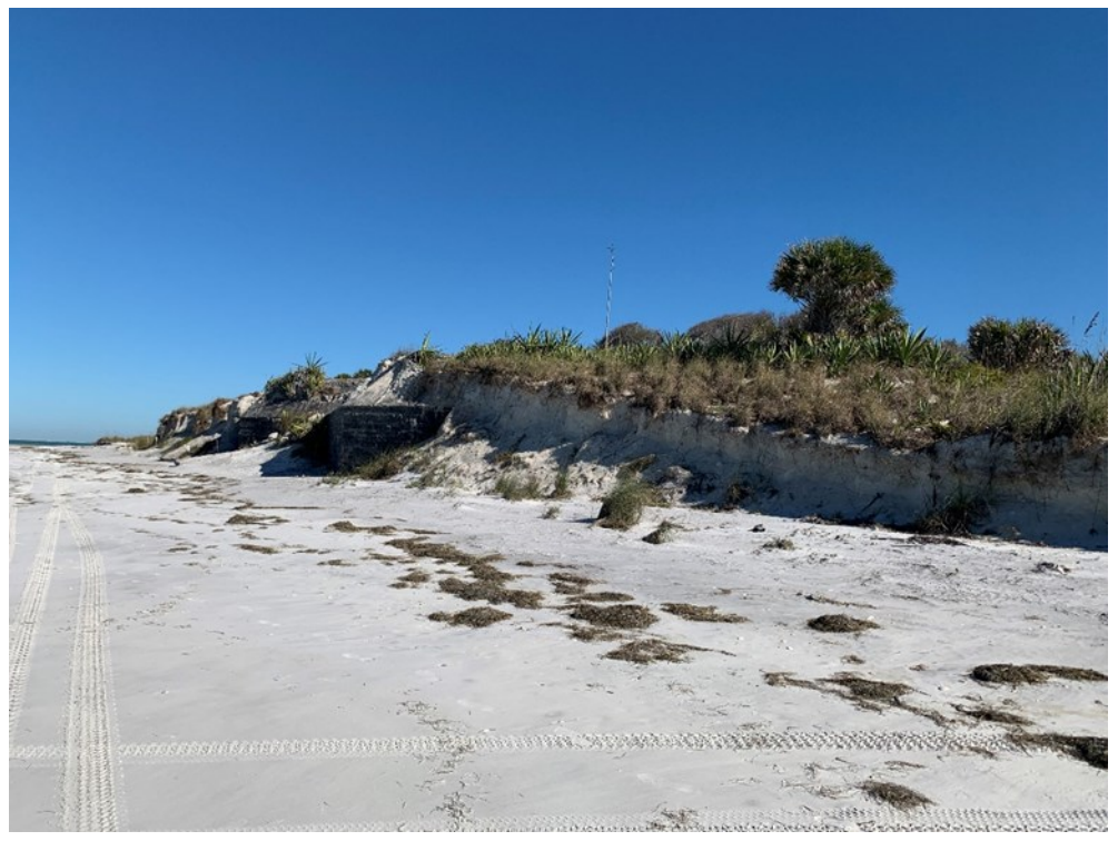
Photo looking north along west shoreline of Egmont Key in January 2022. Note Battery McIntosh exposed on beach.

In addition to the beneficial use opportunities provided by the periodic maintenance dredging of Tampa Harbor, the Corps and Port Tampa Bay recently initiated a study to evaluate potential navigation improvements to the project. This study will evaluate beneficially using large quantities of dredged material from potential future navigation improvement projects for purposes such as the restoration of Egmont Key.