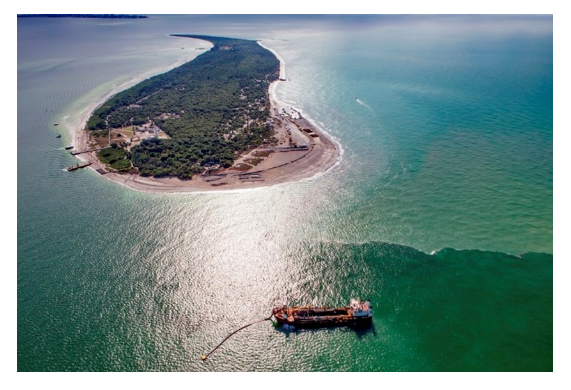
Photo of Egmont Key and Great Lakes Dredge and Dock hopper dredge in December 2014. Next Page

Cultural resources at Egmont Key include remnants of Fort Dade, a U.S. Army coastal defense fort dating back to the 1890s. The remaining historic structures can be found both on the island as well as on the beach and in the Gulf due to nearly a century of erosion since the fort was deactivated. There is also infrastructure on the island critical to supporting safe navigation including the Egmont Key Lighthouse constructed in 1858 and the Tampa Bay Pilots station which was established on its current site about a hundred years ago.