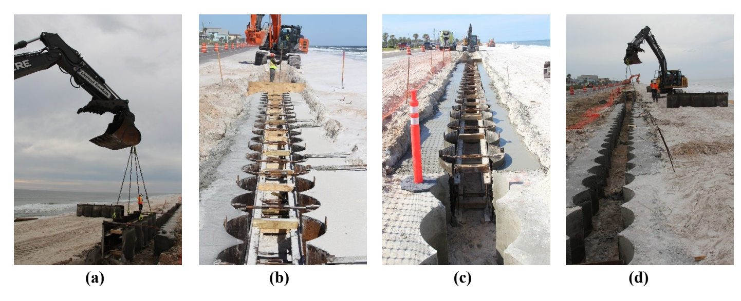
Figure 7: Sequence of guide wall construction to facilitate the secant-pile wall I alignment and installation.