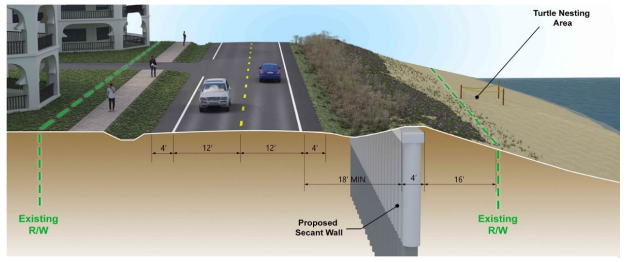
Figure 4: Concept rendering of the completed project for October 2019