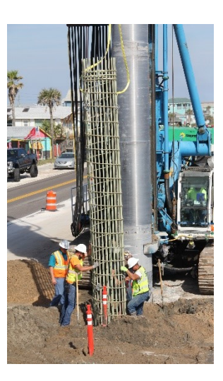
Figure 21: Cage Advancing