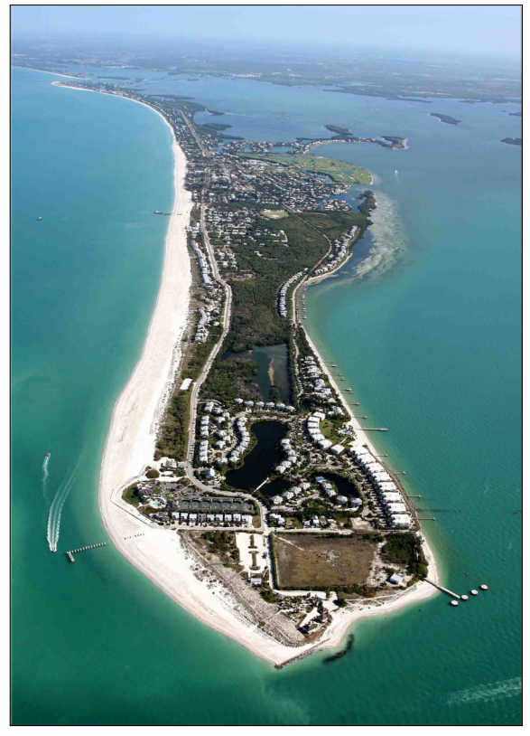
2007 Pre and Post Construction Photos