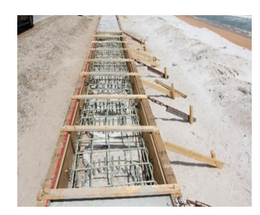
Figure 26: GFRP Pile-Cap rebar installation