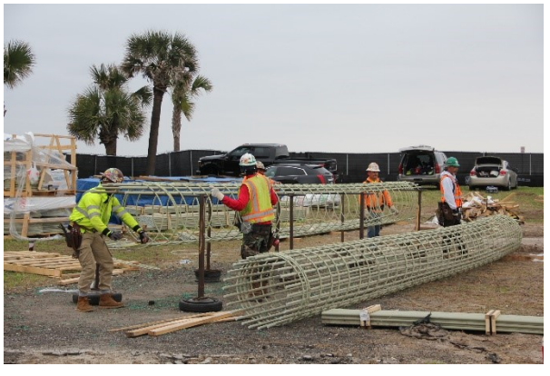
Figure 10: Installation of Continuous Spiral- Ties