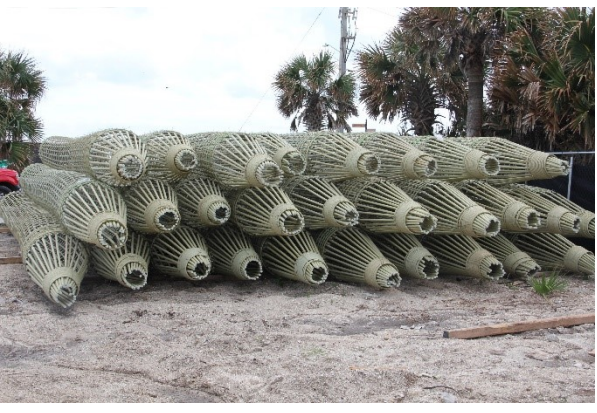
Figure 12: Storage of GFRP secant-pile Cages