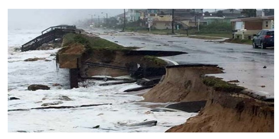
Figure 2: Damage to SR-A1A after Hurricane Matthew in 2016.