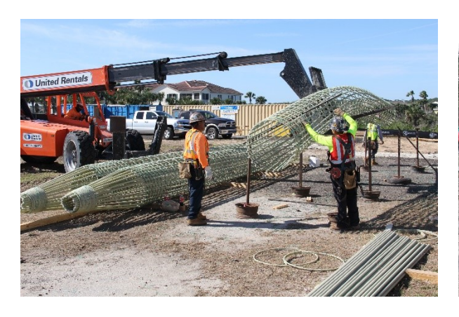
Figure 11: Lifting of GFRP secant-pile Cages