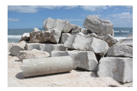
Figure 24. Guide-wall after removal