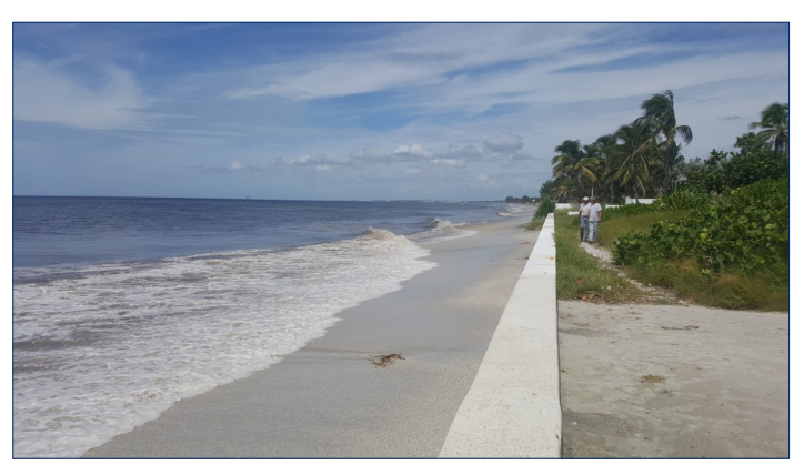
Current Condition of Project Area