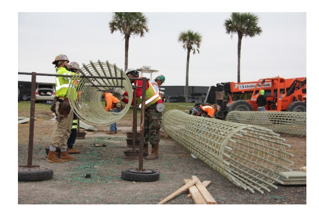
Figure 9: Assembly of GFRP secant-pile Cages

As currently monitored on this project, secant-pile GFRP-rebar cage assembly time savings of 32% to 52% are estimated, compared to a similar steel-rebar cage assembly. These time savings can mostly be attributed to the light weight and flexibility of the GFRP rebars. Figures 9 thru 14 highlight the assembly activities: