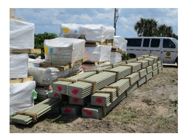
Figure 8: GFRP reinforcing delivery

The main objective of the monitoring effort is to provide quantitative information related to the constructability aspects of the project including: reinforcement transportation, cage assembly, rebar tying, rebar cage lowering, and pile cutting. Deliveries of GFRP rebar to the site are covered for protection during temporary storage, as shown in Figures 8 .