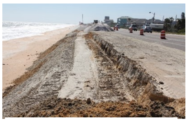
Figure 6: Backfill "cut-in" and step-down-profile.