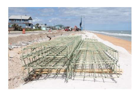
Figure 25: GFRP Pile-Cap rebar cage assemblies.