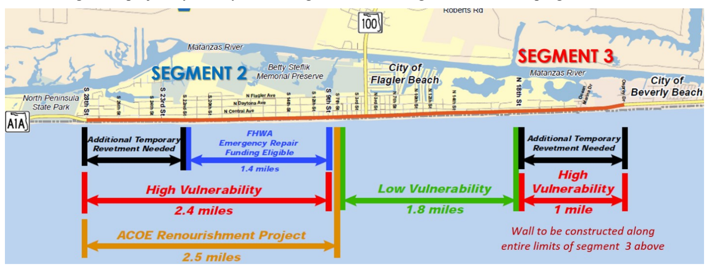
Figure 1: Project location (Segment 3) and hurricane vulnerability comparison.

For this project FDOT engaged the services of RS&H to develop dune restoration and alignment plans, while Mott MacDonald Florida, LLC helped identify and design the optimal context sensitive solution for protecting SR-A1A after decades of threats from seasonal hurricane activity. A major goal of the project apart from functionality and durability, was to also preserve the character of the local environment (both natural and human), including the "Old Florida" feeling that the community embraces. The University of Miami also contributing to the project by closely monitoring and documenting the construction progress, with their