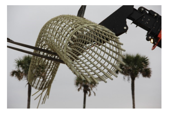
Figure 13: Lifting of GFRP Cage without "Toe"