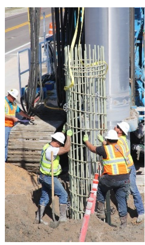
Figure 22: Cage Advancing Figure 23: Cage Installed