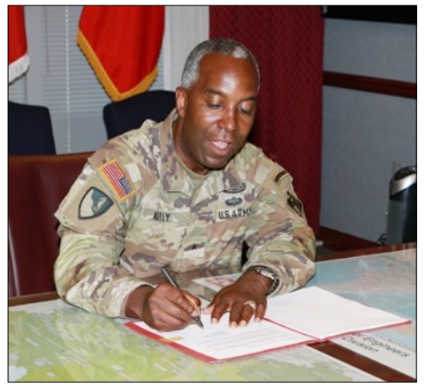
Signing of the SACS Final Report.

In recent years, the U. S. Army Corps of Engineers (Corps) has seen great momentum as an organization moving in a direction of finding sustainable solutions, incorporating resilience and really honing in on natural and nature-based concepts. The South Atlantic Coastal Study, or SACS, was ongoing and active at an opportune time to harmonize with the ongoing collaboration and initiatives.