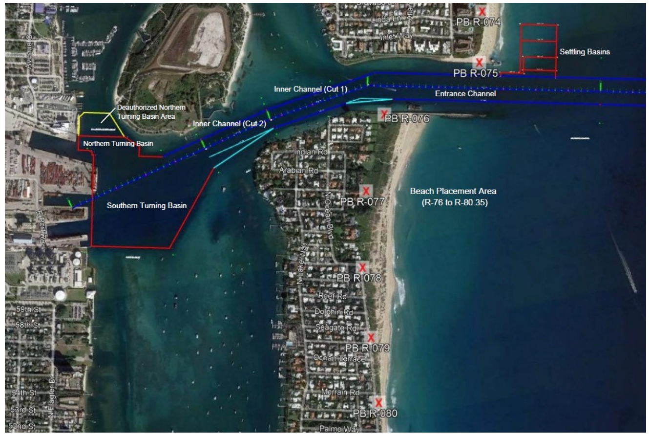
Figure 2: Palm Beach Harbor, Aerial Imagery