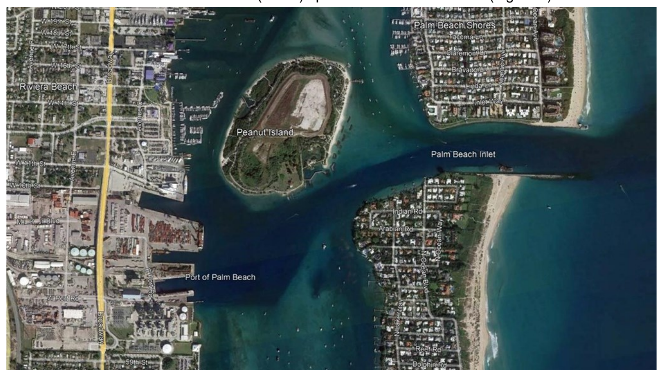
Figure 1: Project is located in Palm Beach County, Florida. Aerial Imagery; Map of Florida inset

The Palm Beach Harbor navigation project is located in Palm Beach County, Florida. The project is associated with the Palm Beach Inlet, also commonly referred to as the Lake Worth Inlet, and its entrance channel lies between the Town of Palm Beach Shores on Singer Island to the north and the Town of Palm Beach on Palm Beach Island to the south. The project's turning basins lie within the Lake Worth Lagoon, east of the Port of Palm Beach District's (Port's) operations in Riviera Beach (Figure 1).