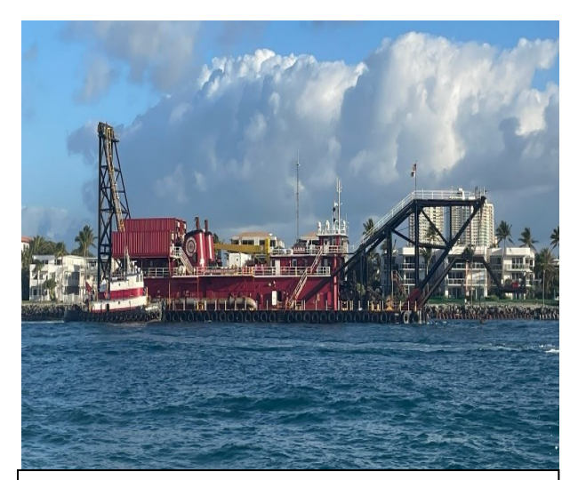
Picture 1. Cutter Suction Dredge Alaska in Palm Beach Harbor entrance channel (2023).

In order to continue placing material after April 30, 2022, coordination between USACE, the FDEP, the Florida Fish and Wildlife Conservation Commission (FWC), and the U.S. Fish and Wildlife Service (FWS) was conducted, and the regulatory agencies concluded under an FDEP permit modification that the time extension would not increase the probability of adverse impacts to nesting marine turtles or other coastal resources. Cashman completed all beach-related activities and demobilized by May 24<sup>th</sup>.