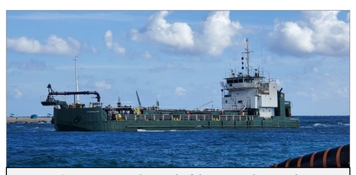
Picture 1. Hopper Dredge Atchafalaya in Palm Beach Harbor entrance channel (2022).

Under the current Florida Department of Environmental Protection (FDEP) joint coastal permit, dredge material from the Palm Beach Harbor project may be placed on the dry beach between R-monument 76 (R-76) and R-80.35 or in the nearshore placement area landward of the -17-foot mean low water (MLW) contour. Each time a harbor maintenance event with dry beach placement is planned, the Port, as the non-Federal sponsor, must provide a lands certification to USACE so that USACE and its contractor may access the beach. Based on the estimated volume of dredge material and the Town-provided beach access location, the USACE, the Port, and the Town identify the properties adjoining the beach placement area that will need temporary construction easements. The Town plays a key role in the Port's lands certification by obtaining the necessary agreements (i.e. temporary construction right-of-entry and temporary construction easements) from the various property owners and assigning those agreements to the Port and USACE for the project's execution.