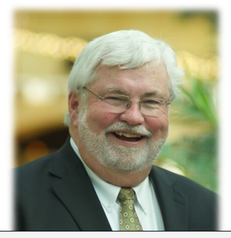
60<sup>th</sup> Anniversary Statesman of the Decade Award Senator Jack Latvala

The collective efforts of our two Diamond Anniversary Award Winners during the 2017 Legislative Session resulted in a win for Florida's beaches when the Legislature provided unprecedented annual funding of $50M, and recognized as well as funded the top three ranked inlet management projects as part of the traditional beach management program. We anticipate the implementation of these inlet projects will bring greater attention to the importance of inlet improvements and the need to ensure more reliable sources of sand for beaches for years to come.