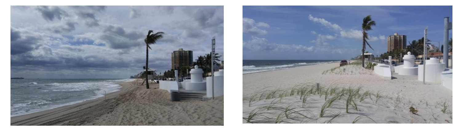
Portions of Broward County Segment II Shore Protection Project completed in 2016. Before & After photos taken at NE 18<sup>th</sup> Street, located just a few miles north of the Westin.

Please join us for this unique educational opportunity and tour Broward County's Segment II coastline, inlet to inlet, and learn how important sand bypassing is to the County's beach management program. Reserve your seat today by registering at <u>mail@fsbpa.com</u>.