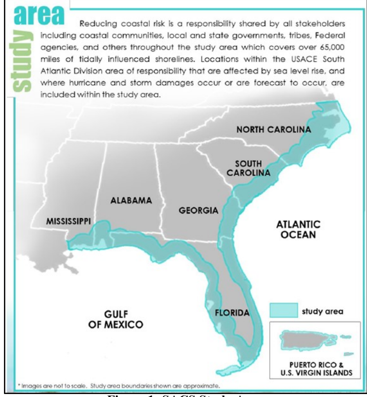
Figure 1: SACS Study Area

The U.S. Army Corps of Engineers (USACE) is conducting a comprehensive coastal vulnerability and flood risk-reduction study within the South Atlantic Division which includes over 65,000 miles of tidally influenced shoreline (Figure 1). This study is known as the South Atlantic Coastal Study (SACS) and it is modeled after the North Atlantic Coast Comprehensive Study (NACCS), which was conducted along the North Atlantic coastline following Hurricane Sandy. The SACS has multiple key products; a Risk Assessment based on factors including population, infrastructure, environmental and cultural resources, and social vulnerabilities; the Coastal Hazards System (CHS), which includes four models that will provide current and projected water elevation data for the study area; State Appendices that will identify focus areas for each state, document existing risk reduction strategies and potential risk reduction strategies will be assessed for future implementation; and the Sand Availability and Needs Determination (SAND). This article will provide an overview of the SAND.