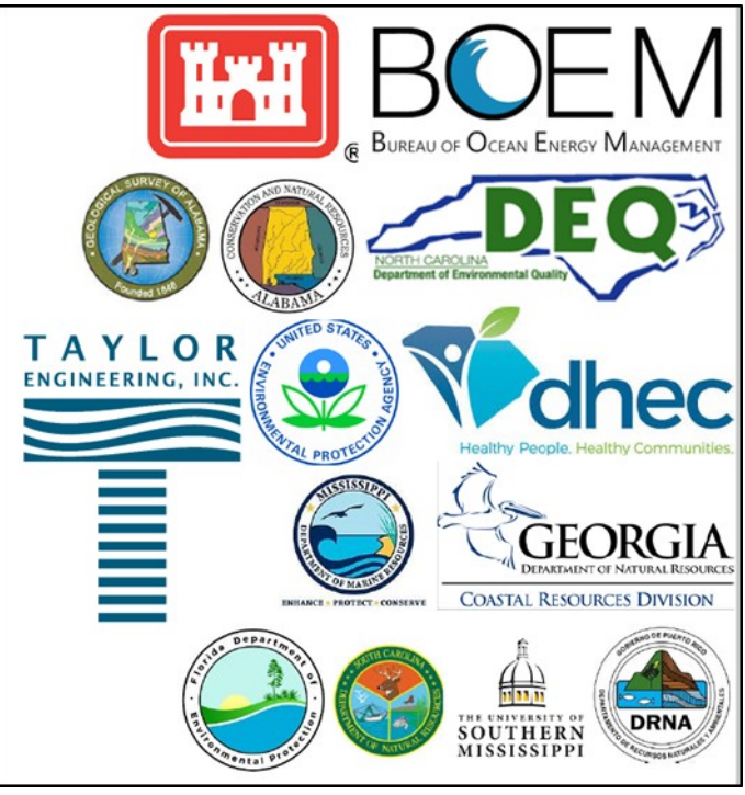
Figure 2: The SAND Project Delivery Team

The SAND study is currently in the process of gathering data on sand needs and availability through active engagement with coastal stakeholders. Beach nourishment projects that are being included in the sand needs database are those that have had nourishments with a single placement volume exceeding 100,000 cubic yards (cy) of sand, as well as those that have been replenished within the past 10 years. Estimated sand needs will be determined for the next 50 years (2020 to 2070).