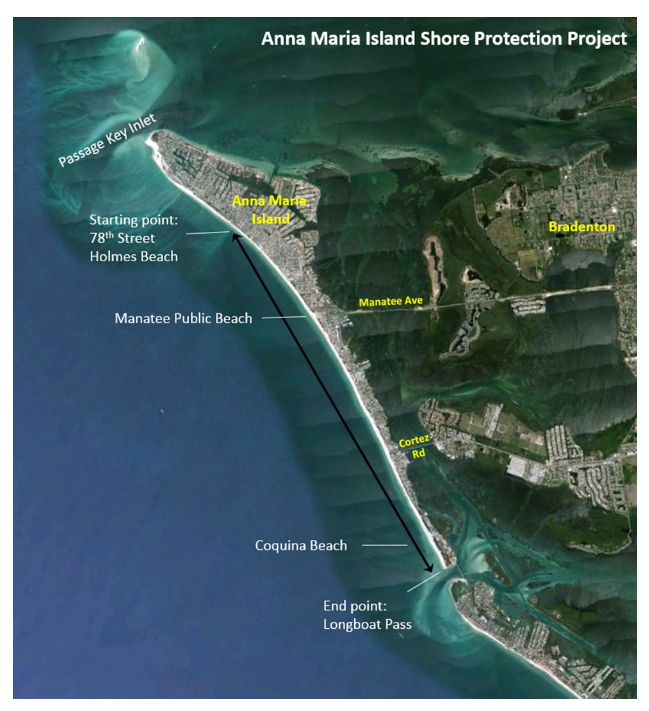
Figure 1: 2020 Beach Nourishment Extents