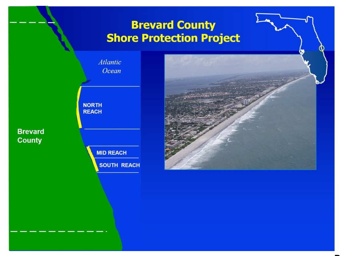
Figure 1: Brevard County Shore Protection Project Segments

Mobilization for the project is expected to begin in November 2020 and will require closing portions of the beach. Updates will be provided on the Jacksonville District Facebook site located here: <a href="https://www.facebook.com/JacksonvilleDistrict">https://www.facebook.com/JacksonvilleDistrict</a>