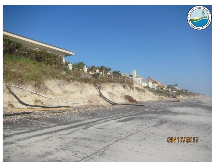
Post Hurricane Irma, St. Johns County.

The Governor's budget document breaks out the Hurricane Irma recovery/repair funding from the traditional beach management funding in two separate lineitems (1594, 1597). As he did last year, the Governor recommended our much celebrated current year funding level of $50M for the traditional statewide beach program (Approx. $20.5M General Revenue and $29.5M LATF). This is a great "base budget" starting point. As part